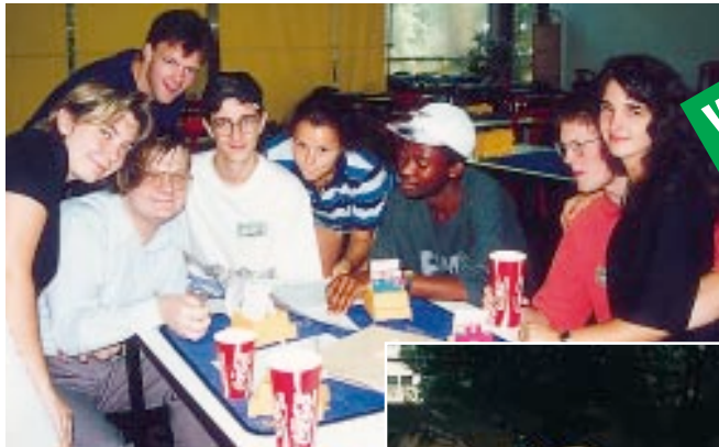
• International team prepares for the treasure hunt: an educational and recreational stroll in the streets of the old town.