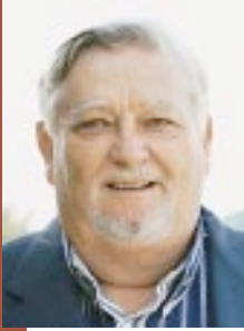
Nissan Rand Seniors Cmtee Chairman