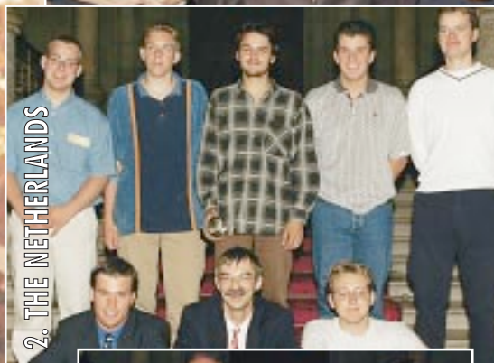
2. THE NETHERLANDS