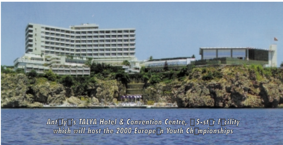
Antalya's TALYA Hotel & Convention Centre, a 5-star facility which will host the 2000 European Youth Championships

ANTALYA, a primary tourist resort destination on Turkey's south coast will be the host of the 17th European Youth Championships , which will take place 6-16 July 2000.